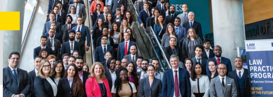
2017/2018 LPP Candidates

to our work placement employers, our strategic partner, the Ontario Bar Association and The Law Society of Ontario.