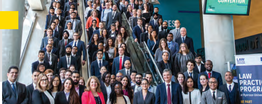
2017/2018 LPP Candidates

to our mentors, assessors, curriculum developers, guest speakers, the Ontario Bar Association for our strategic alliance, and The Law Society of Ontario.