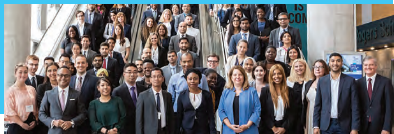
2018/2019 LPP Candidates

Looking forward to the 2019–2020 Law Practice Program