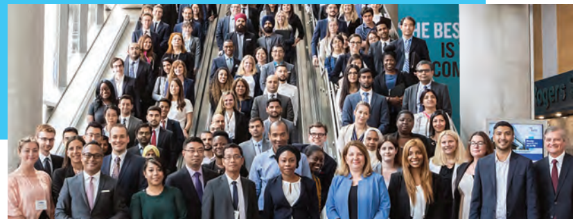
2018/2019 LPP Candidates